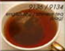
9136 / 9134 english tea (bag) / royal oolong