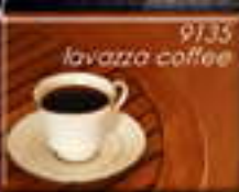
9135 lavazza coffee