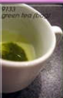
9133 green tea (bag)