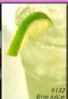
9132 lime juice