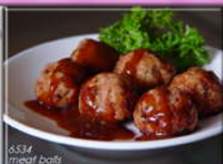
6534 meat balls