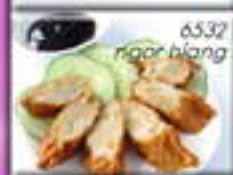
6532 ngor hiang