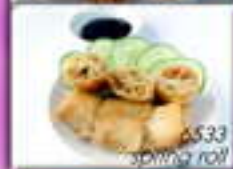
6533 spring roll