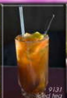
9131 iced tea