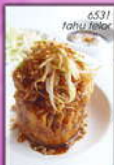
6531 tahu telor